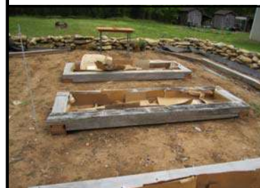
Interior Raised-Bed Timbers

Our Growth-Strategy Campaign began in March 2013. We are approaching compatible organizations to establish long-term, working relationships. Annual membership entitles each organization to one free meeting use of our Log Cabin and inclusion of their Logo and Website address in this Email-based Newsletter that is presently distributed to over 500 members and interested prospects.