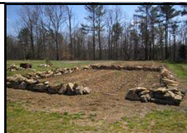
Garden Perimeter Boulder Walls

A 2013 United Way of Franklin County Grant Application was submitted and our presentation made to secure help with the funding of our fall Colonial Hearth Day. We are extending the Event from one- to two-days and participation from 100 to 200 fourth-grade underprivileged students from all Franklin County elementary schools.