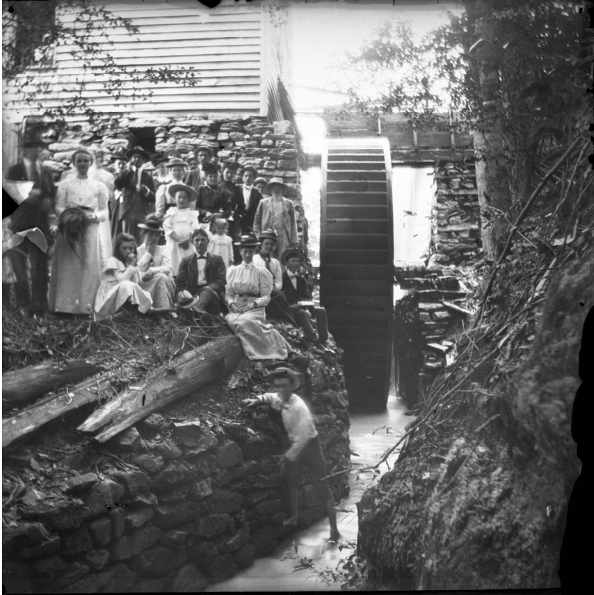
GILL MILL (Picnic/Wedding photo?)