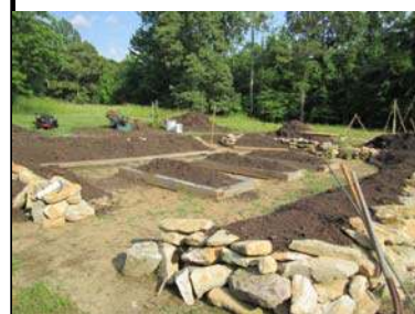
Composted Plant Beds

Our Growth-Strategy Campaign began in March 2013. We are approaching compatible organizations to establish long-term, working relationships. Annual membership entitles each organization to one free meeting use of our Log Cabin and inclusion of their Logo and Website address in this Email-based Newsletter that is presently distributed to over 500 members and interested prospects.