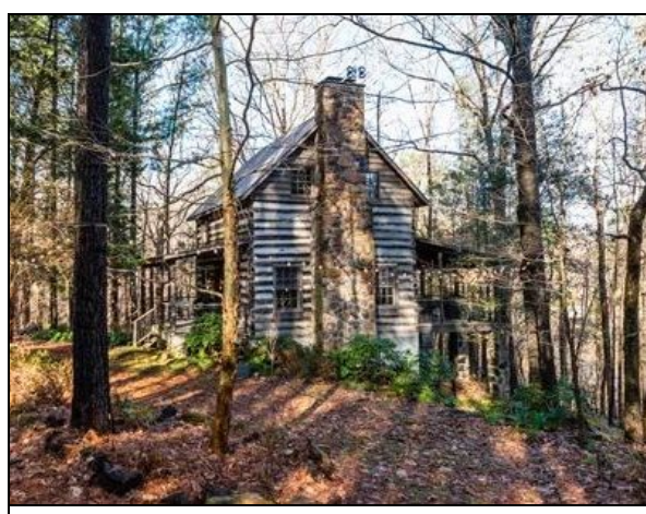
LYNCH CREEK FARM CABIN CLICK IMAGE TO GOOGLE MY BUSINESS

Welcome to <u>Lynch Creek Farm</u> an exceptional Business Meeting, Dining and Entertainment Venue recognized by the Raleigh News & Observer (N&O) as the "<u>Best Kept Secret in Franklin County</u>"