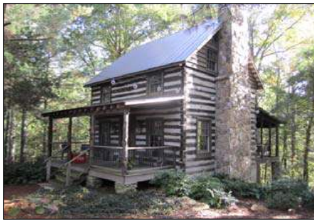
LYNCH CREEK FARM CABIN 1973 ROCKY FORD ROAD KITTRELL, NC 27544

SOCIETY MEMBERS MEET TO SHARE INFORMATION ABOUT OUR SERVICE PROJECTS. MEETINGS ARE HELD AT OUR CABIN HEADQUARTERS AT: